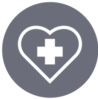
FIRST AID SUPPLIES